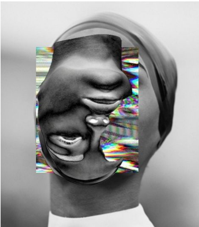
Nkiru Oparah, Precursor to a dream, 2014. Photograph: Nkiru Oparah

Jepchumba of Africandigitalart.com presents us the digital collage , in Africa a growing form of art that utilises technology to produce a range of artworks, incorporating digital video, animation, photography, animated gif's and digital photo manipulation.