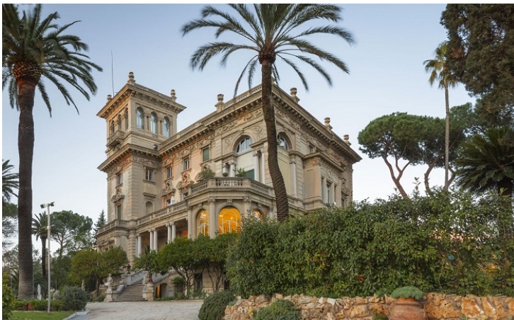
image of Villa Maraini, Istituto Svizzero di Roma

Follow the conference online on Zoom here .