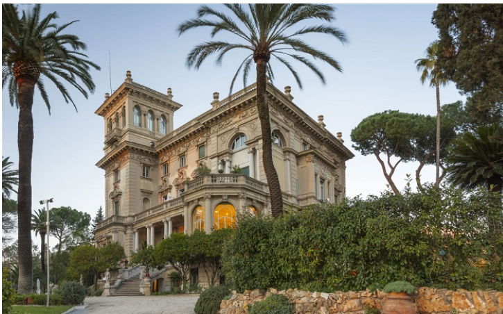
image of Villa Maraini, Istituto Svizzero di Roma

Follow the conference online on Zoom here .