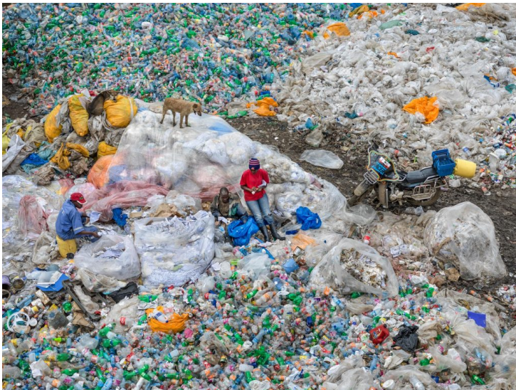
Dandora Landfill #3 Plastics Recycling Nairobi Kenya 2016

In the photographs Burtynsky's lens captures breakwater barriers, natural resource extraction processes and oil bunkering in the Niger Delta, deforestation, large transport infrastructures, climate change, lithium, copper and coal mines and many different forms of pollution.