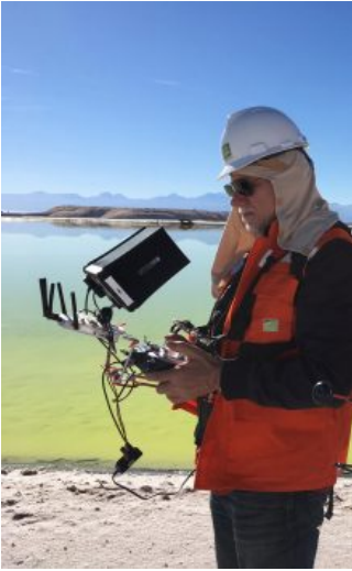
Edward Burtynsky on location at SQM lithium operation Chile

In the photographs Burtynsky's lens captures breakwater barriers, natural resource extraction processes and oil bunkering in the Niger Delta, deforestation, large transport infrastructures, climate change, lithium, copper and coal mines and many different forms of pollution.