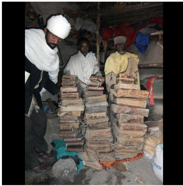
The priests of May Wäyni monastery with the manuscripts

Screenshot of the home page of EAP, regarding the May Wayni manuscripts. We can see three priests who show the ancient manuscripts; https://eap.bl.uk/project/EAP526