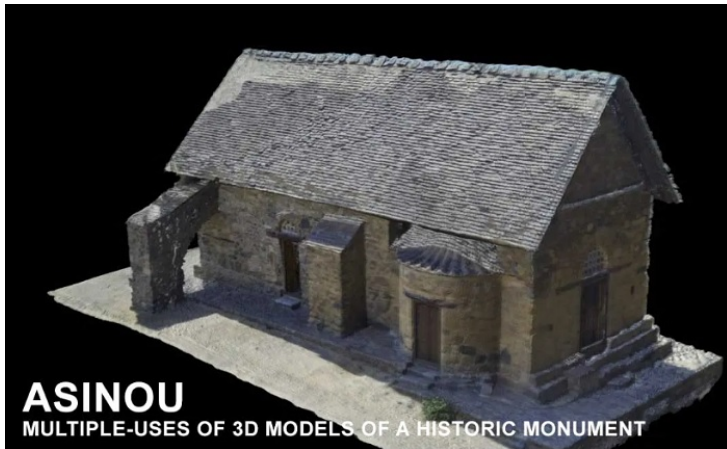
3D model of Asinou church

share digitised objects, with a particular focus on 3D digitization and knowledge modelling for the semantically enriched 3D records.