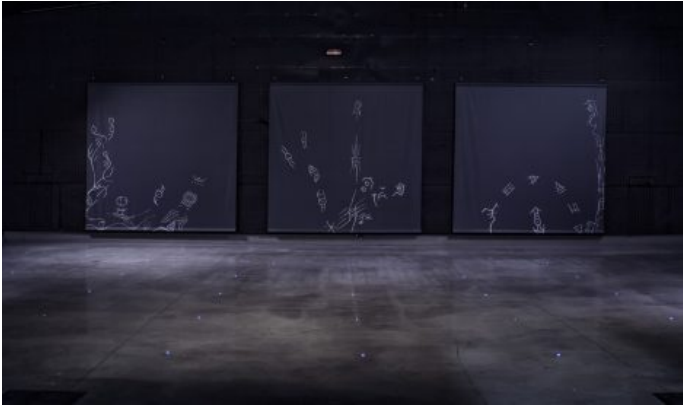
Graphiae Installation at Milan Malpensa International Airport GR9-10-11

Graphiae, the digital artist Gianluca Cingolani's new project, was unveiled at Porta di Milano, Terminal 1 of Milan Malpensa International Airport.