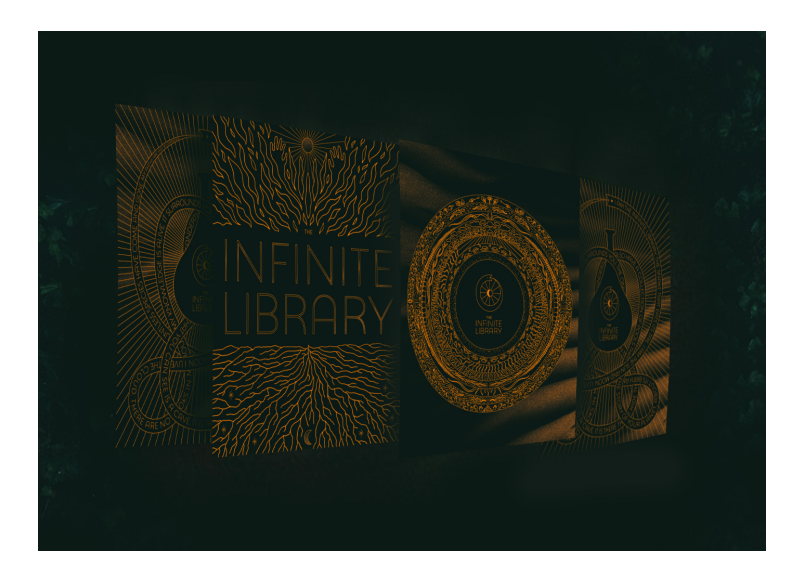
The-Infinite-Library A hint of the artistic programme of the 5th Little islands Festival. ] Exploratory Artistic Processes - In Search of Neiko