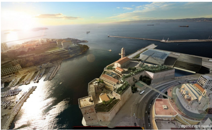
Fort Saint Jean

When: Wednesday, May 20, 2015 , 9:00 ? 17:30