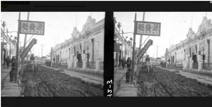
Acheng (China), muddy city street; date of photograph: between 1931 and 1932

to landscapes. Each photograph can be selected for further information: Title, Date of Photograph, Photographer's Note, Subject, Continent, General Region, State/Province, Type of Image and Original Item Medium, Digital Format, Original Collection, Provenance, Rights etc.