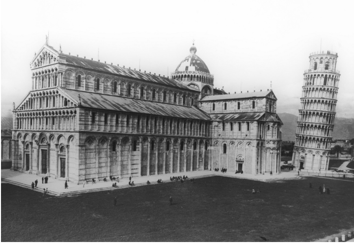
image: Piazza dei Miracoli a Pisa

Organized by Photoconsortium in cooperation with the Museo della Grafica and University of Pisa and hosted at the Palazzo Lanfranchi, in the very city center on the banks of the river Arno, this 1-day conference invited leading speakers from the Citizen Heritage consortium partners and other experts in digital cultural heritage, in Social Sciences and Humanities research and in the use of participatory approaches in a cultural and/or educational context.