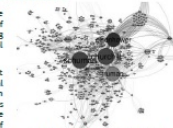
Part of the actual network of the people named in articles in De Telegraaf in 1953 including the word 'Europe'.

For example, we can represent collections of articles as a social network. Each node and relation in the social network contains information such as a link to the original sources and the list of relevant concepts discussed in the articles in which each person name appears.