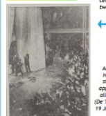
The Rolling Stones in the Heque: an image showing the connection between youth and violence. (De Telegraaf, 10 August 1964)

Clusters of words that appear near the word 'metropolis' in The Times. The first image (top) is for the period 1850-1900, the second one 1900-1950. It gives an indication that discussions of the city shift from an emphasis on health, water issues, sewage, and death in the nineteenth century to emphasizing the police and courts in the twentieth.