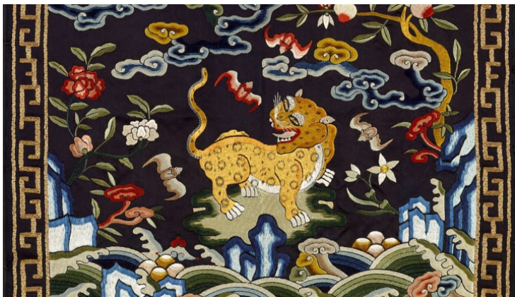
image: Rank Badge with Leopard, Wave and Sun Motifs, China, Qing dynasty (1644-1911), late 18th century, silk and metallic thread, Metropolitan Museum of Art, 30.75.1025 .

Being so deeply embedded in the Europeana ecosystem, the new CEF project PAGODE ? Europeana China (2020-2021) fully embraces the advocacy towards more open access content to be made available online in repositories like Europeana . The effort of cultural heritage institutions in showcasing their gems in digital format goes hand in hand with their mission of sharing this cultural heritage at large, for the benefit and enjoyment of the entire community.