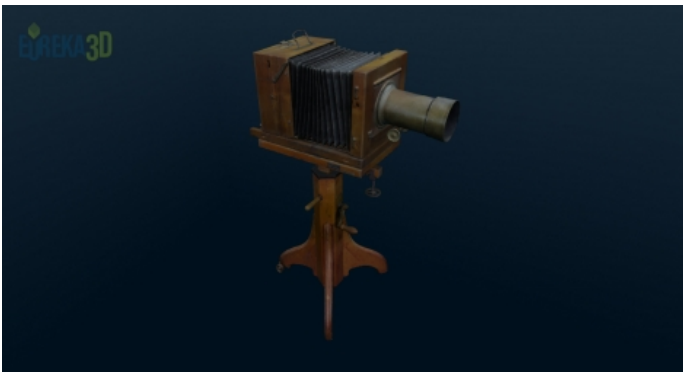
Voigtländer & John (objective) | Ajuntament de Girona

Step into the world of history and heritage through stunning 3D collections that bring the past to life. From pre-cinema artifacts in Girona to everyday objects and cultural emblems from the ancient oppidum of Bibracte in Burgundy, these collections offer a unique window into the lives and creativity of our ancestors. Digitised and shared in the context of the EUreka3D project , these treasures showcase the value of preserving and exploring our shared cultural heritage.