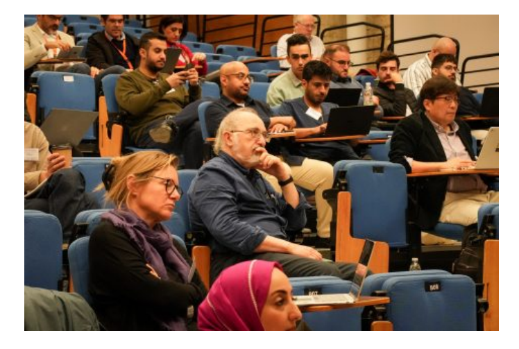
Audience at the opening