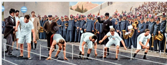
0812988.jpg The line up for the 100 metres, 1896 Athens Olympics, Greece.