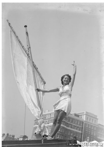
Holiday makers at Brighton 1937

TopFoto supplies primarily editorial content to clients but is extremely diverse and its pictures are reproduced in all areas of visual publication. TopFoto was a pioneer in digitisation and electronic transfer and through new technologies has formed close links to international partners in over 40 countries around the world.