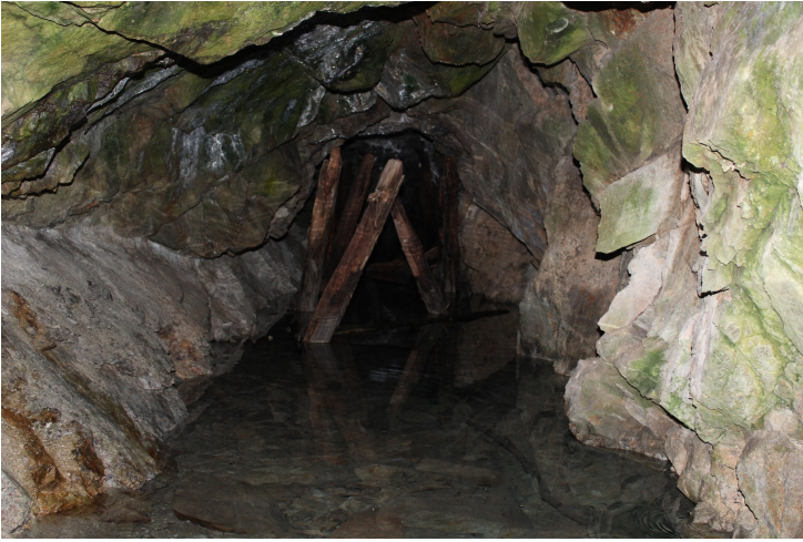
The mining site in Spania Dolina

Matej Bel University is coordinating an impressive action for territorial and tourist promotion in the INCULTUM Pilot 3 Mining Treasures of Central Slovakia in the region which has significant cultural and technical heritage related to its mining history. As part of this work, a new website was recently developed in the Pilot to offer information and other services that promote the area and its touristic offer. In the context of this action, in the period February-march 2022 a creative training for the University students was organised together with the ICT company that is in charge of the web platform, with the scope of engaging students in a challenge to create proposals for the logo and visual identity of the website 'Mining Treasures of Central Slovakia' (mining treasures = banické poklady).